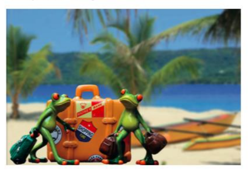
Sentence 1: Include an expanded noun phrase.

Use this picture as inspiration to carefully think and write a short paragraph about the summer holiday adventures of Mr and Mrs Frog.